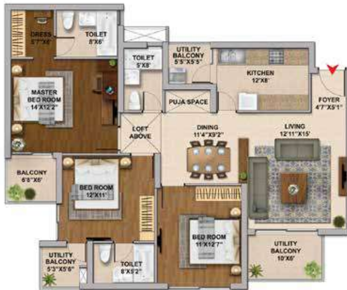
APARTMENT- 1 & 2 | TOWER- 5 & 7