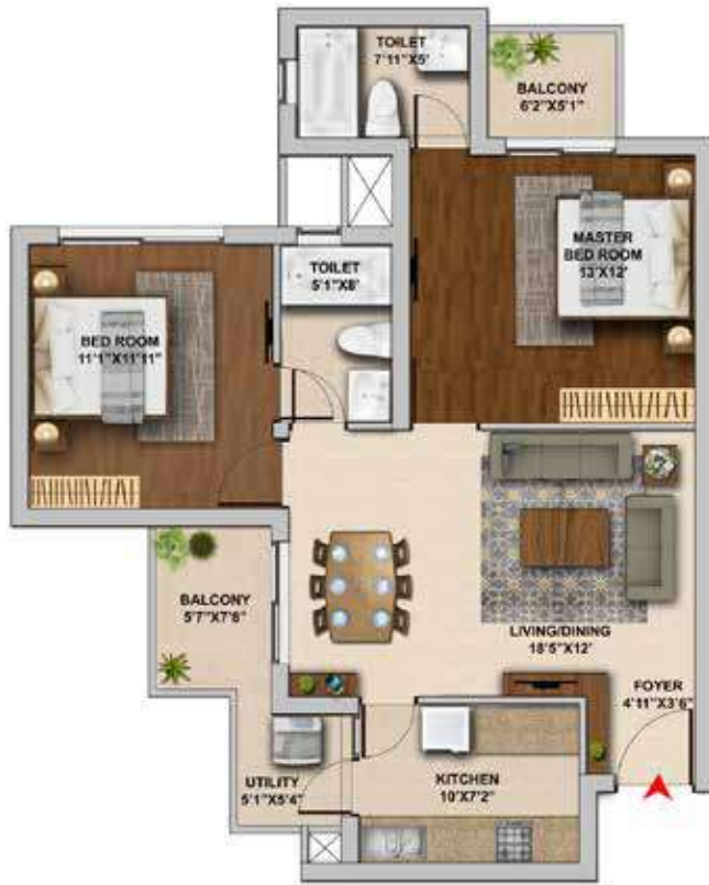
2 BHK SMART APARTMENT LAYOUT