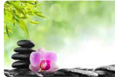
UTKARSH, HARIDWAR Premium Plots