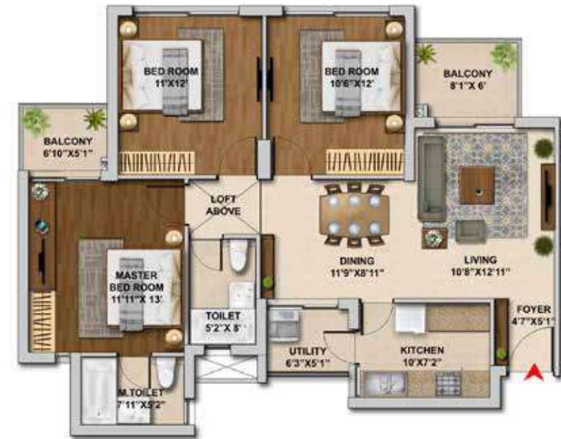
APARTMENT- 3 & 4 | TOWER- 5 & 7