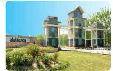
ALAKNANDA, HARIDWAR Your dream home in the land of Gods