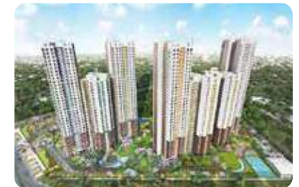
HERO HOMES, GURUGRAM World of Wellness