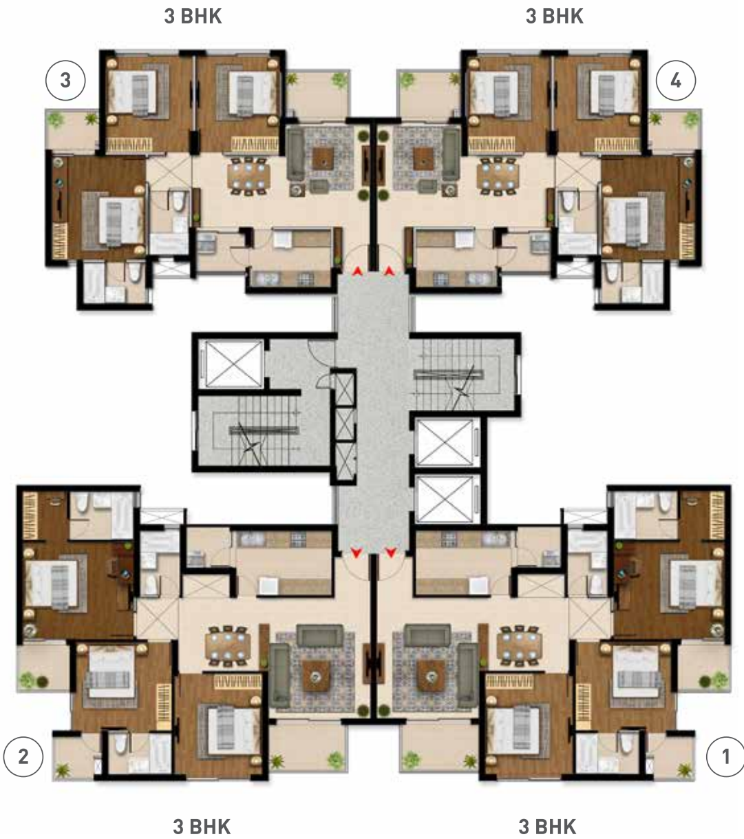
CLUSTER PLAN, TOWER - 5&7