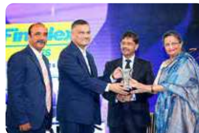
HARIDWAR GREENS-BEST TOWNSHIP PROJECT OF THE YEAR Under 200 acres at NDTV Property Awards 2017