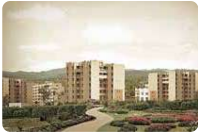
HARIDWAR GREENS Step into your new home with neighbours waiting to welcome you