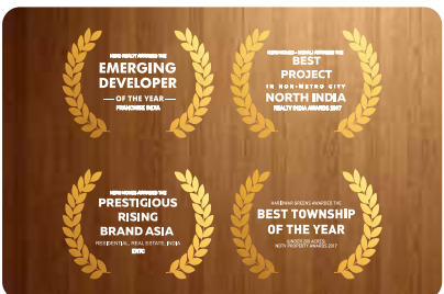
AWARDS Our prized possession awaits you