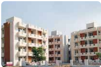
GHARAUNDA, HARIDWAR Your perfect home