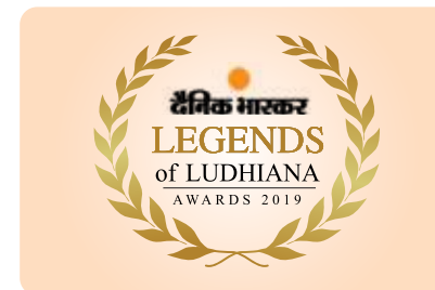
HERO HOMES, LUDHIANA-THE 'BEST ECO-FRIENDLY PROJECT 2019' AWARD. Dainik Bhaskar Award 2019