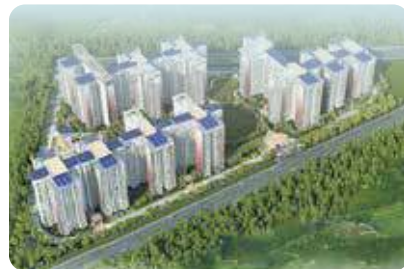
HERO HOMES, LUDHIANA Enjoy the perfect blend of luxury and serenity