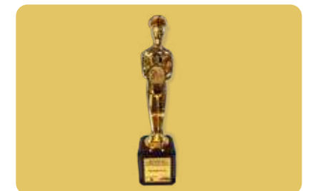
HERO HOMES GURUGRAM-BEST RESIDENTIAL PROJECT OF THE YEAR at the Prestigious EPC World Awards 2019