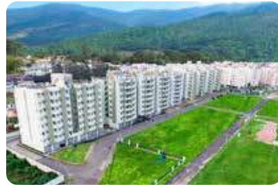
HOLIDAY HOMES, HARIDWAR Your home set amidst the lap of nature