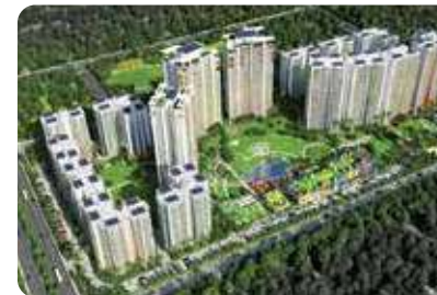
HERO HOMES, MOHALI An abode of exceptional living